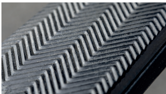
GrippFix black 8 mm thick