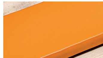
Spray coating for all-around coatings and complex surface geometries from 3 mm thickness