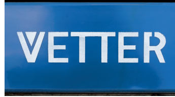
Polyurethane blue Surface without tread 5 mm thick / FDA-certified* (food application)