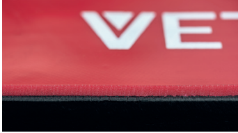
Polyurethane red Surface without tread 5 / 10 mm thick