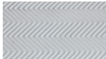
GrippFix white 6 mm thick (food application)