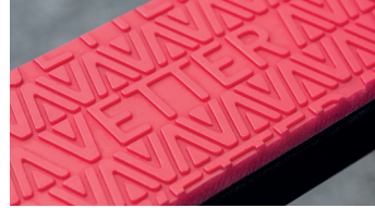
Polyurethane red Profiled surface 7 mm thick